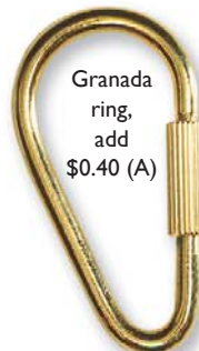
Granada ring, add $0.40 (A)