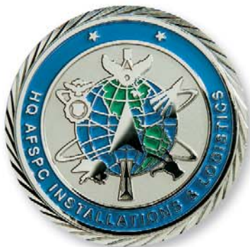
Spiral cut edge