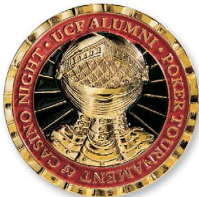
Diamond cut edge

Suggested here: Enhancements to your medallion that add eye-appeal! Call our Pin Consultants for pricing.