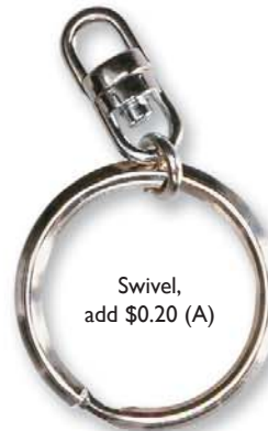
Swivel, add $0.20 (A)