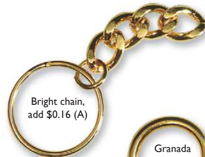
Bright chain, add $0.16 (A)