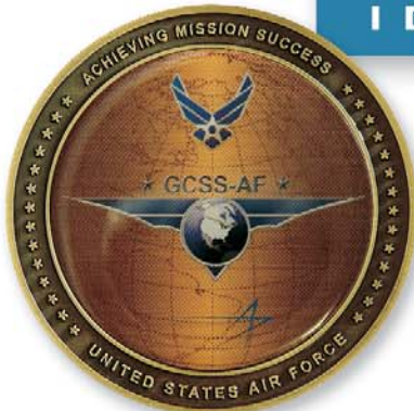
4-color process insert