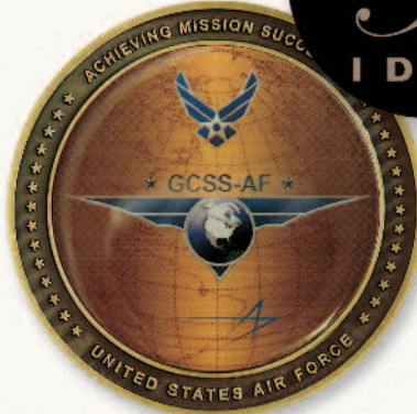
4-color process insert

Suggested here: Enhancements to your medallion that add eye-appeal! Call our Pin Consultants for pricing.