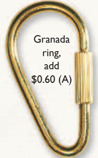
Granada ring, add $0.60 (A)