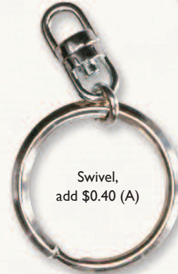
Swivel, add $0.40 (A)