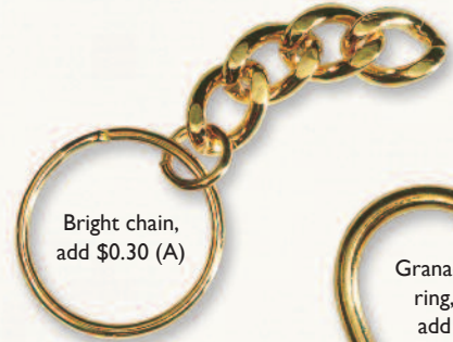
Bright chain, add $0.30 (A)