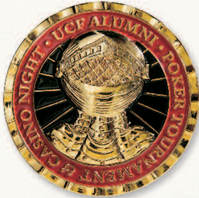
Diamond cut edge

Suggested here: Enhancements to your medallion that add eye-appeal! Call our Pin Consultants for pricing.