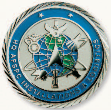
Spiral cut edge